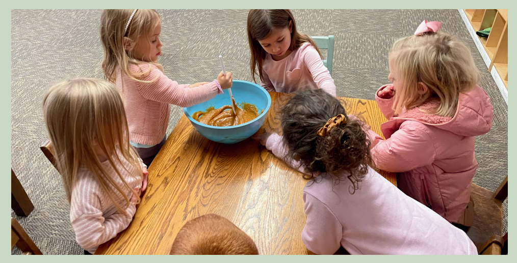
We had such a fun time working on fall activities and making muffins and are grateful we could share time during our Family Thanksgiving Celebration. In December we are looking forward to learning about different holidays, working on skills and concepts through holiday themes and various creative endeavors. We will end the year with a Family Holiday Sing & Celebration!