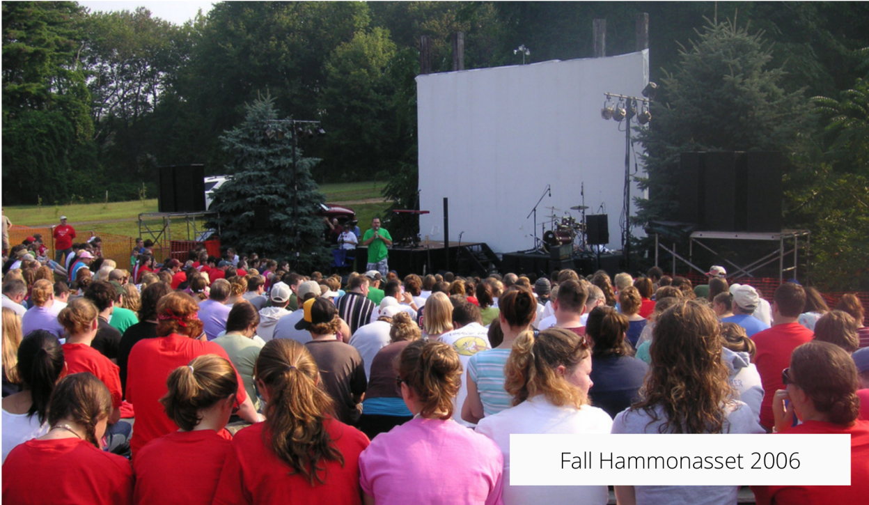
Fall Hammonasset 2006