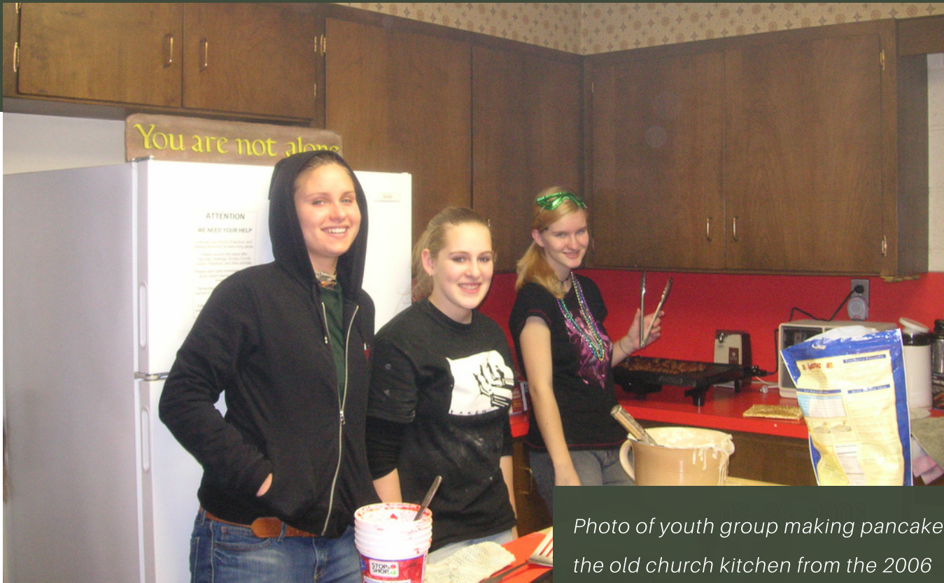
Photo of youth group making pancakes in the old church kitchen from the 2006 pancake supper.

Greetings beloved community of St. James,