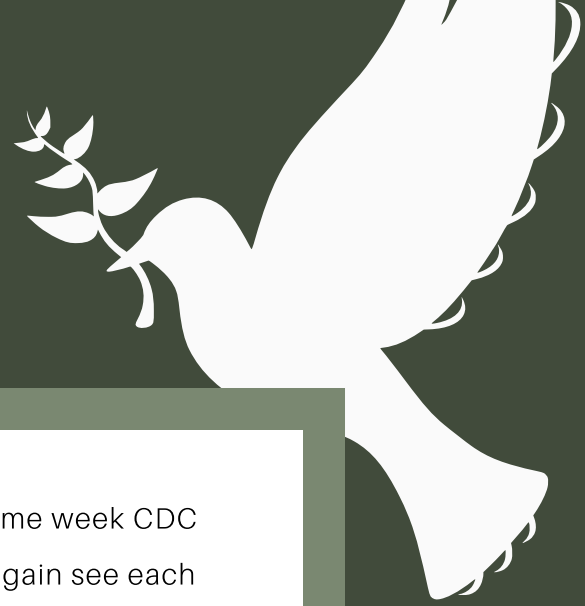
table. That's true of our churches, too. Coincidentally, that was the same week CDC guidelines permitted masks to become optional and we could once again see each other face-to-face. We are slowly rediscovering gathering.

So, what does it mean to gather? And what have we learned from its absence? For one, there is no substitute to sharing space. We may have known it before, but we feel that reality differently as a result, deeper somehow. All the online streaming in the world can't heal the need of belonging quite like physical attendance - like sitting down next to someone, greeting them, passing the peace with hug or handshake. That said, we've also learned that technology can be a gift. However imperfect, seeing someone's face, hearing someone's voice, being mutually attentive and present in a virtual space is a form of gathering. It is not solely dependent on physical space. We can still be with each other, care for each other, when we are apart. We can still be church without a building.